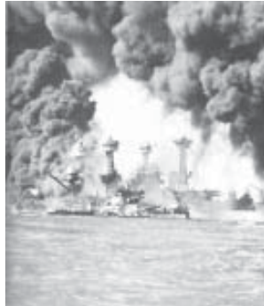
The Bombing of Pearl Harbor

isolationism. In his Farewell Address, George Washington proclaimed that Europe had "a set of primary interests which to us have none or a very remote relation," and that America should "steer clear of permanent alliances." Expansion and wars followed without America wavering from this stance. Even in WWI the US fought as an associate power to Anglo-French forces, not as an ally. America rejected the Treaty of Versailles, and refused to join the