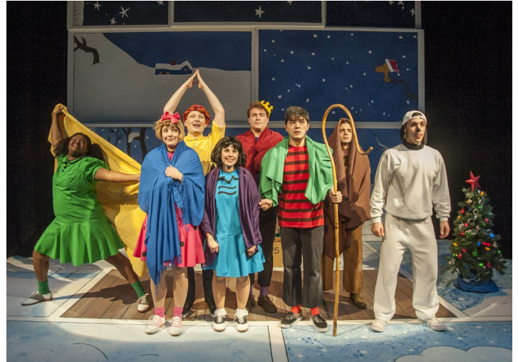
The cast of Taproot Theatre's 2017 production of A Charlie Brown Christmas .