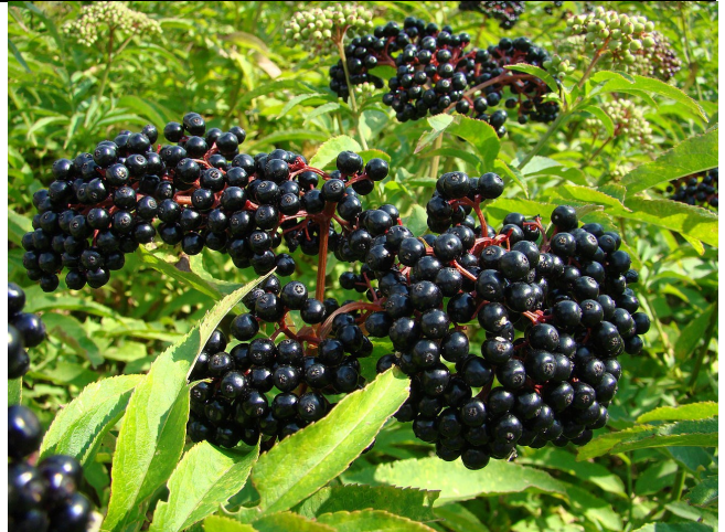
Red Stemmed Elderberries or Sambucus wikipedia.org/wiki/Sambucus

winemakersdepot.com/Elderberry-Wine-Recipe-W76.aspx